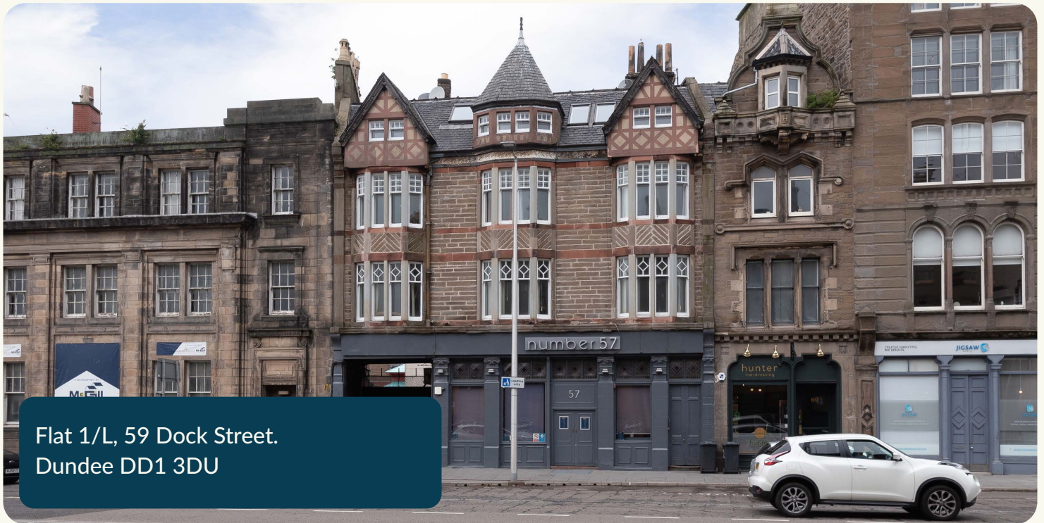
Flat 1/L, 59 Dock Street. Dundee DD1 3DU