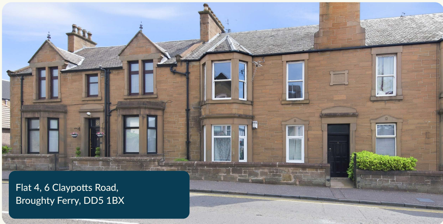
Flat 4, 6 Claypotts Road, Broughty Ferry, DD5 1BX