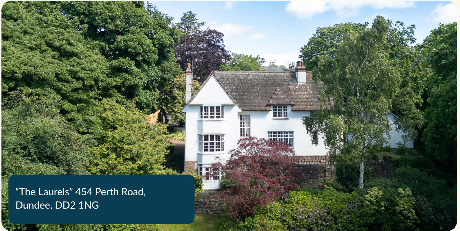
"The Laurels" 454 Perth Road, Dundee, DD2 1NG