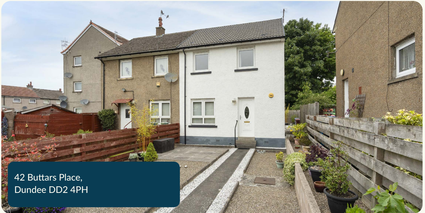
42 Buttars Place, Dundee DD2 4PH