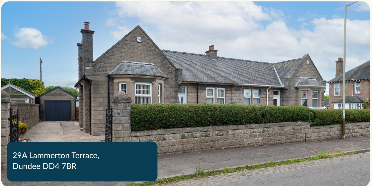
29A Lammerton Terrace, Dundee DD4 7BR