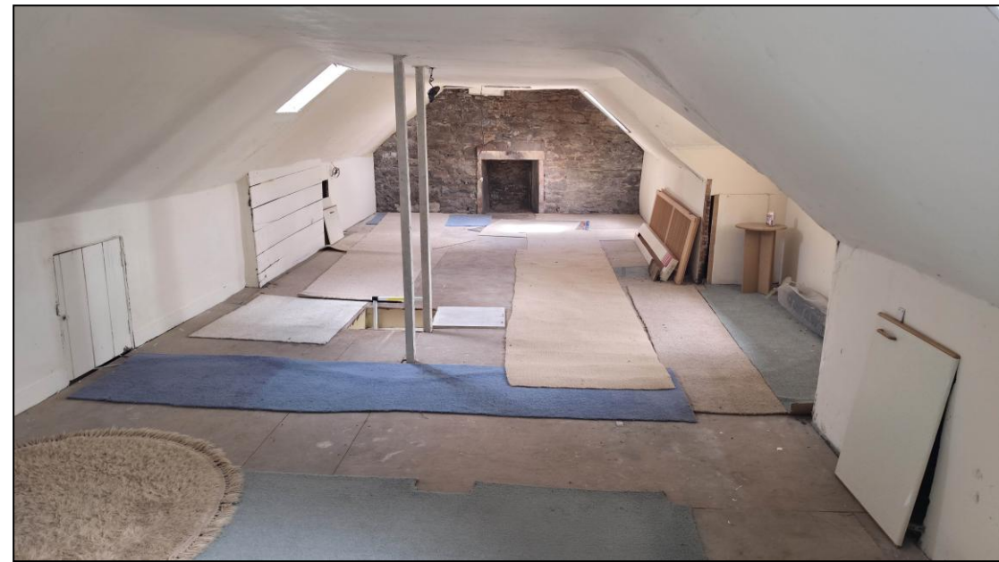
Illustration for identification purposes only, measurements are approximate, not to scale. Fourlabs.co © (ID1304544)