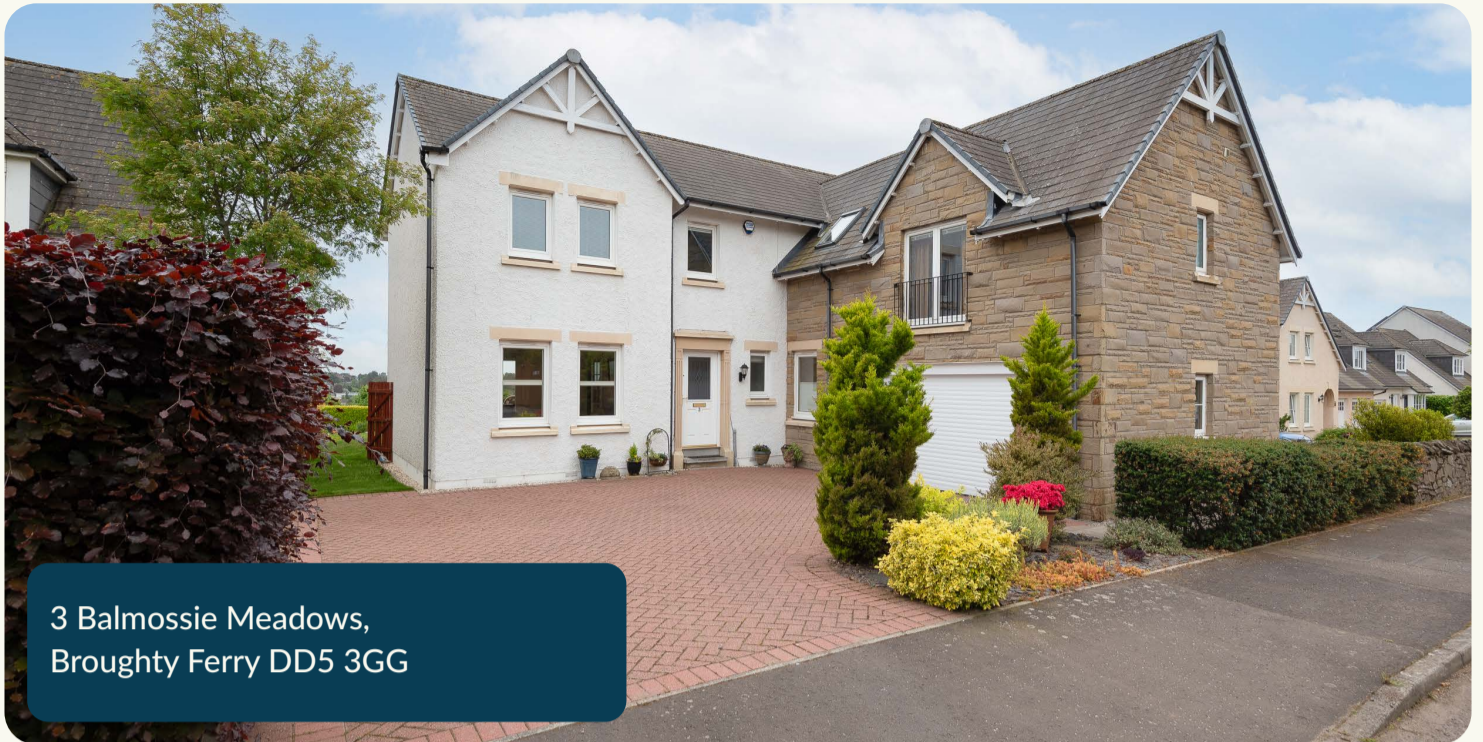
3 Balmossie Meadows, Broughty Ferry DD5 3GG