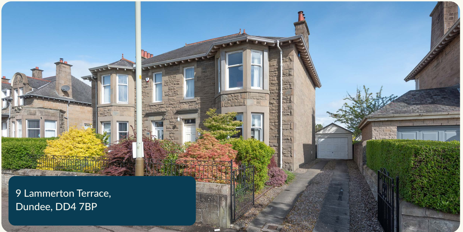
9 Lammerton Terrace, Dundee, DD4 7BP