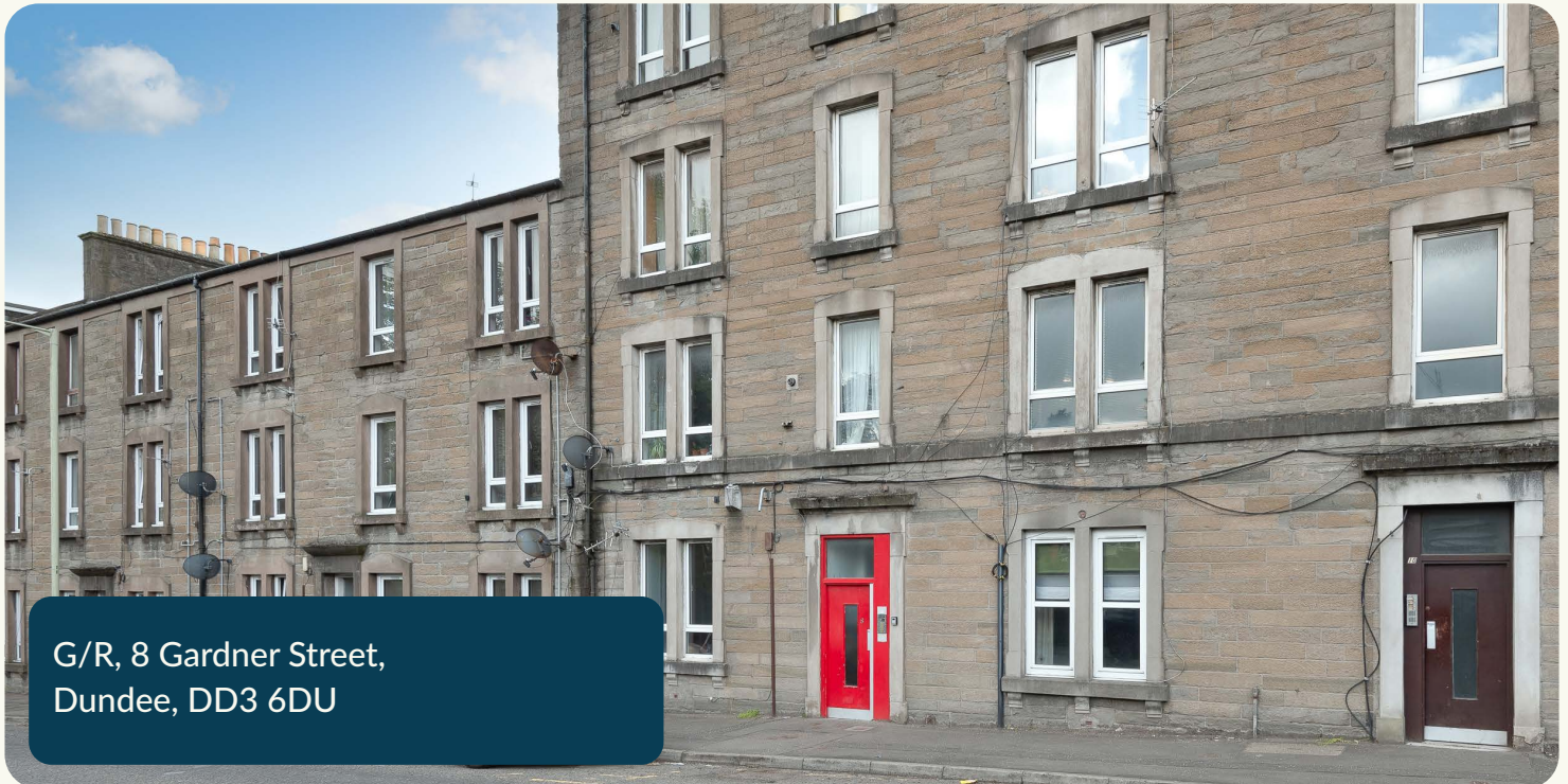
G/R, 8 Gardner Street, Dundee, DD3 6DU