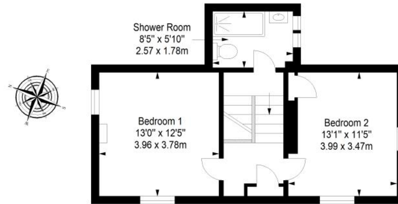
Ground Floor Approx. 49.3 sq. metres (530.7 sq. feet)