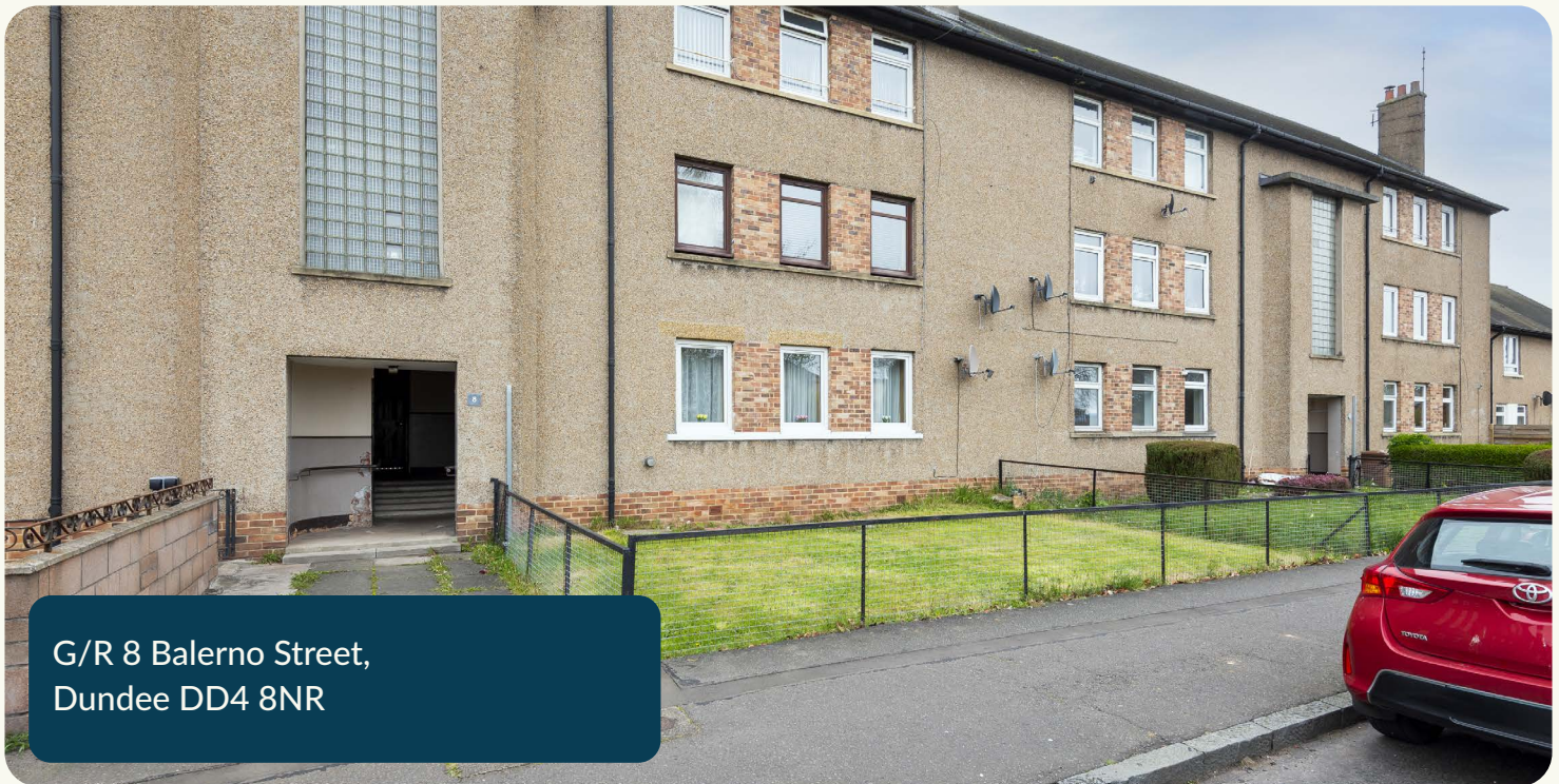
G/R 8 Balerno Street, Dundee DD4 8NR