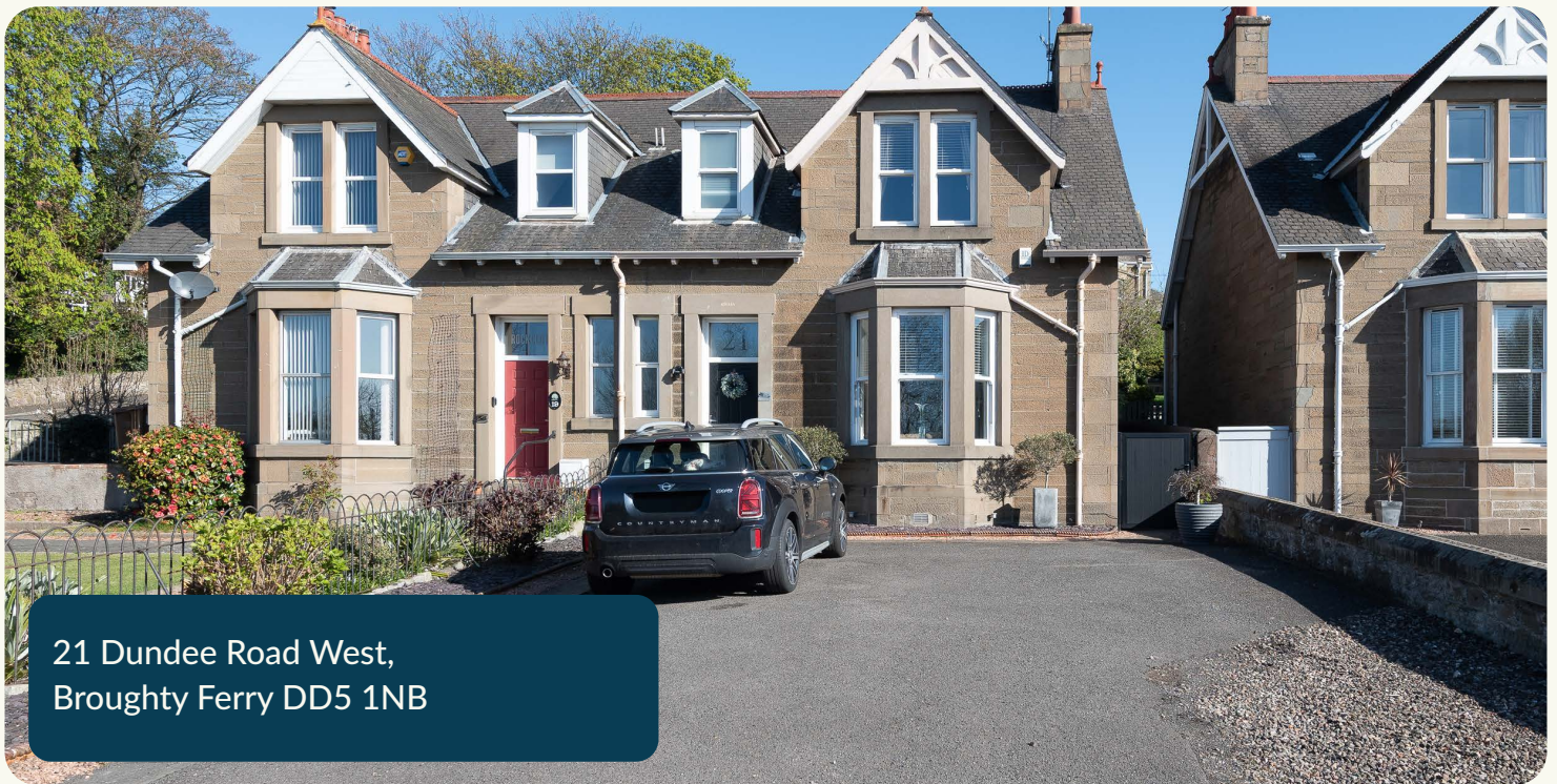
21 Dundee Road West, Broughty Ferry DD5 1NB