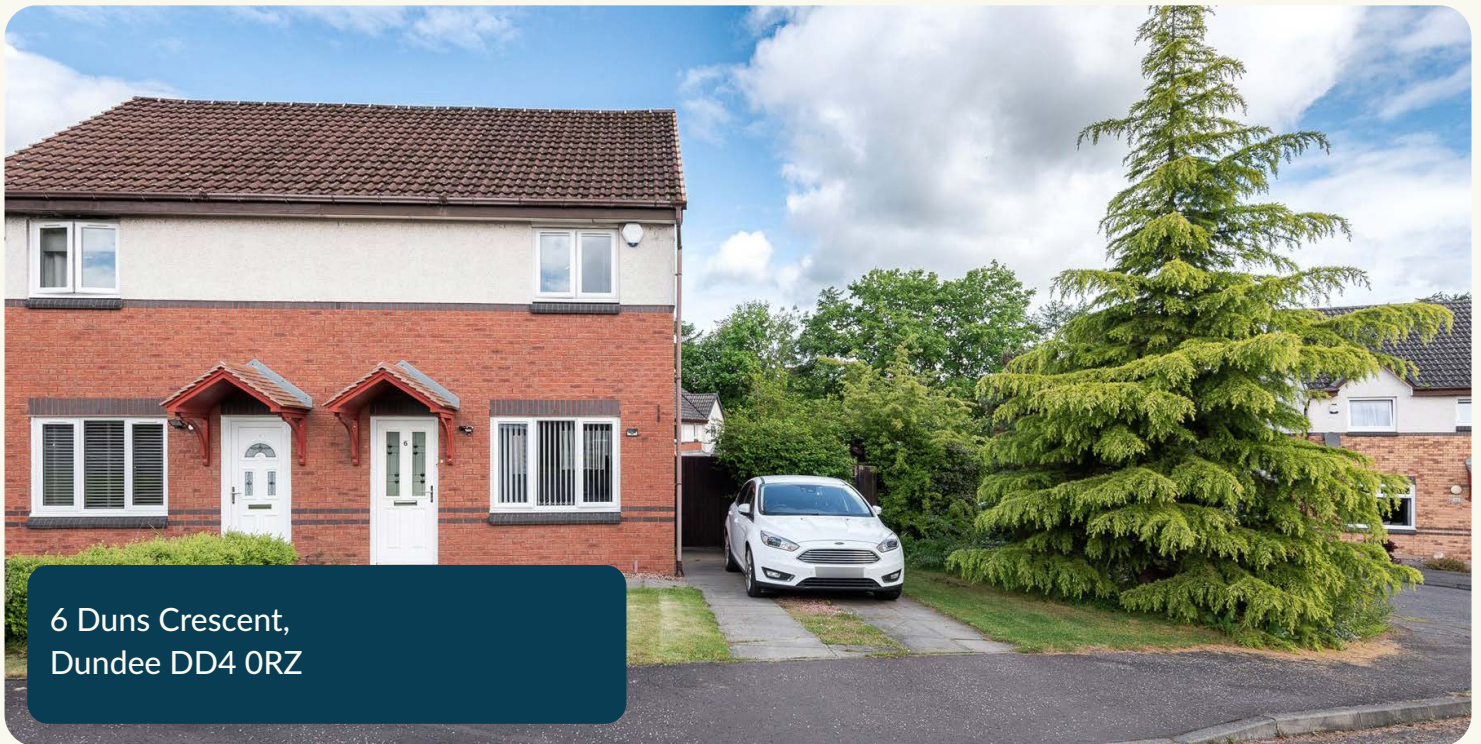
6 Duns Crescent, Dundee DD4 0RZ