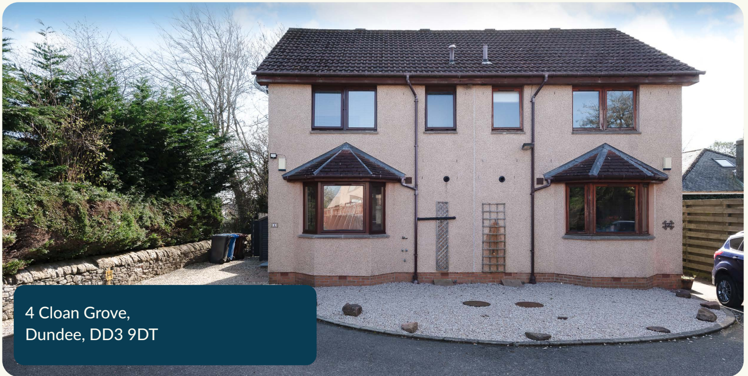
4 Cloan Grove, Dundee, DD3 9DT