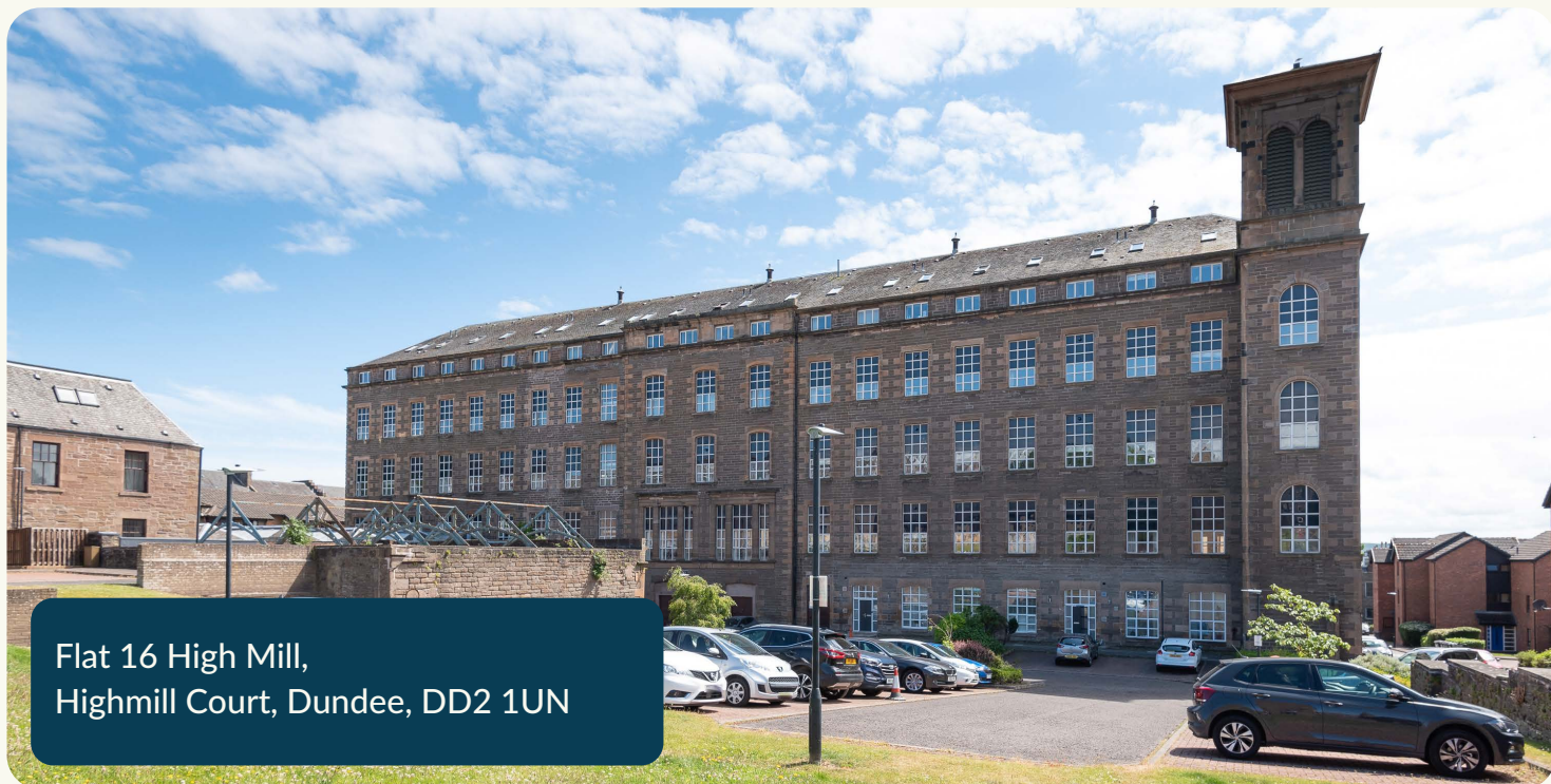
Flat 16 High Mill, Highmill Court, Dundee, DD2 1UN