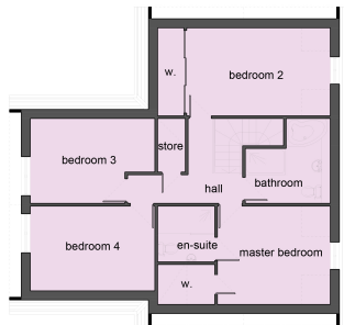
First Floor Plan (Plot 1)