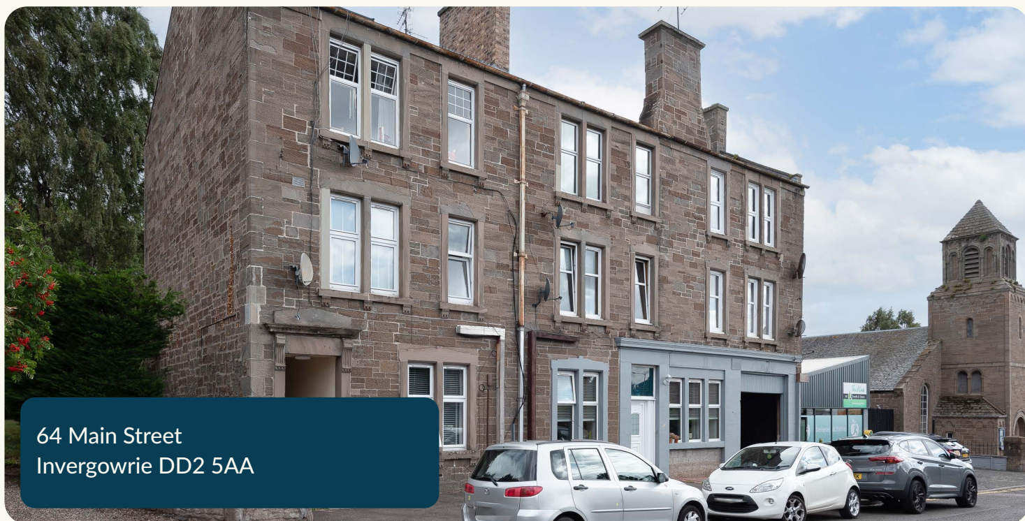
64 Main Street Invergowrie DD2 5AA