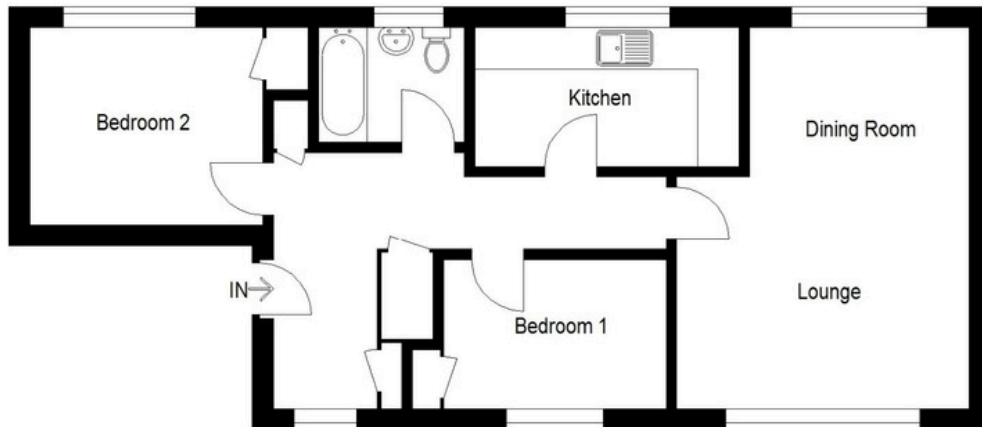
Illustration For Identification Purposes Only. Not To Scale (ID:1216410 / Ref:90859)