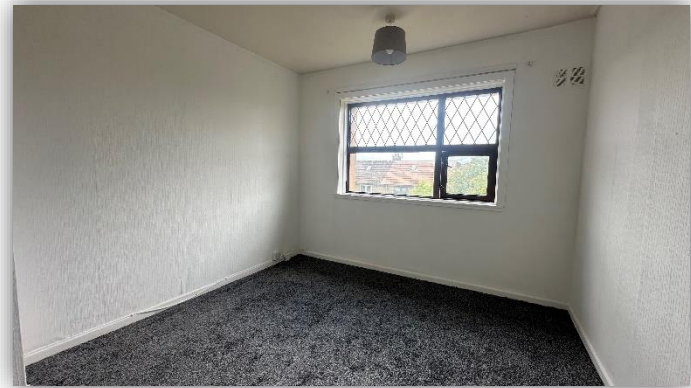
FIRST FLOOR 67.0 sq.m. approx.