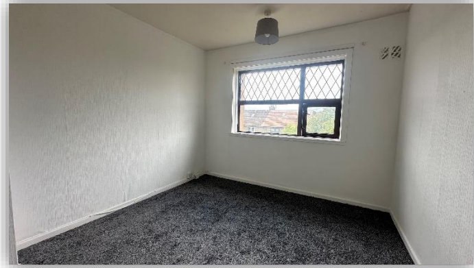
FIRST FLOOR 67.0 sq.m. approx.