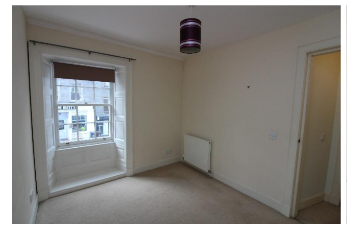
Approx. 2.57m x 3.11m. A well proportioned room. Double glazed sash and case style windows looking to front.