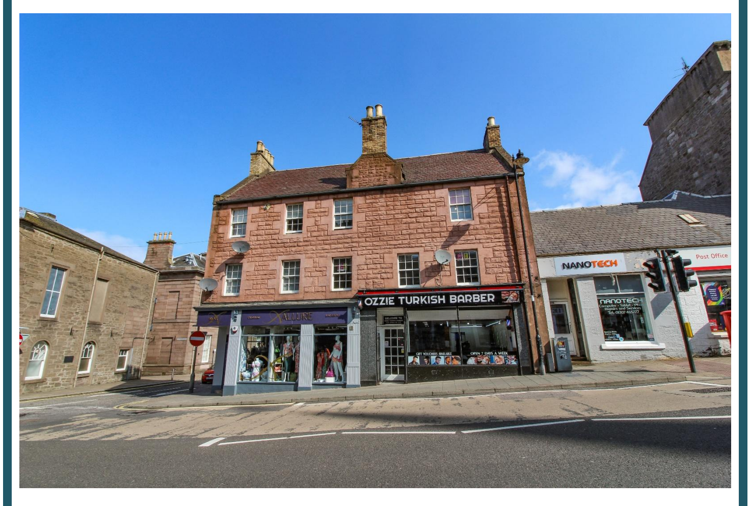
Flat 3, 2 Castle Street, Forfar DD8 3AD