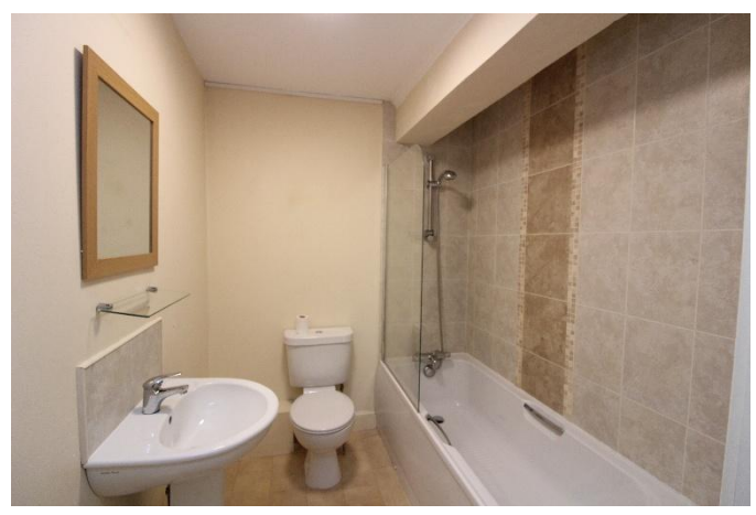
Approx. 2.33m x 1.81. Three piece modern white suite comprising WC, wash hand basin and bath. Shower over bath with shower screen. Part tiled. Extractor fan. Heated ladder style towel rail.