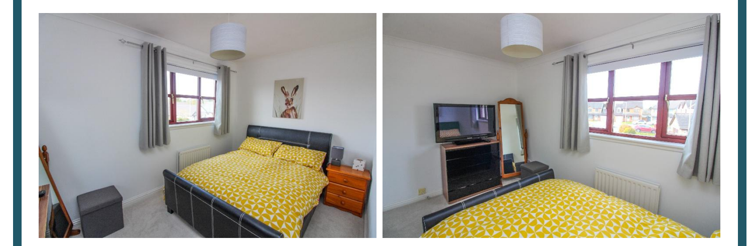
Approx. 3.65m x 2.4m. Double bedroom. Double glazed window to front again enjoying views towards the Glens.