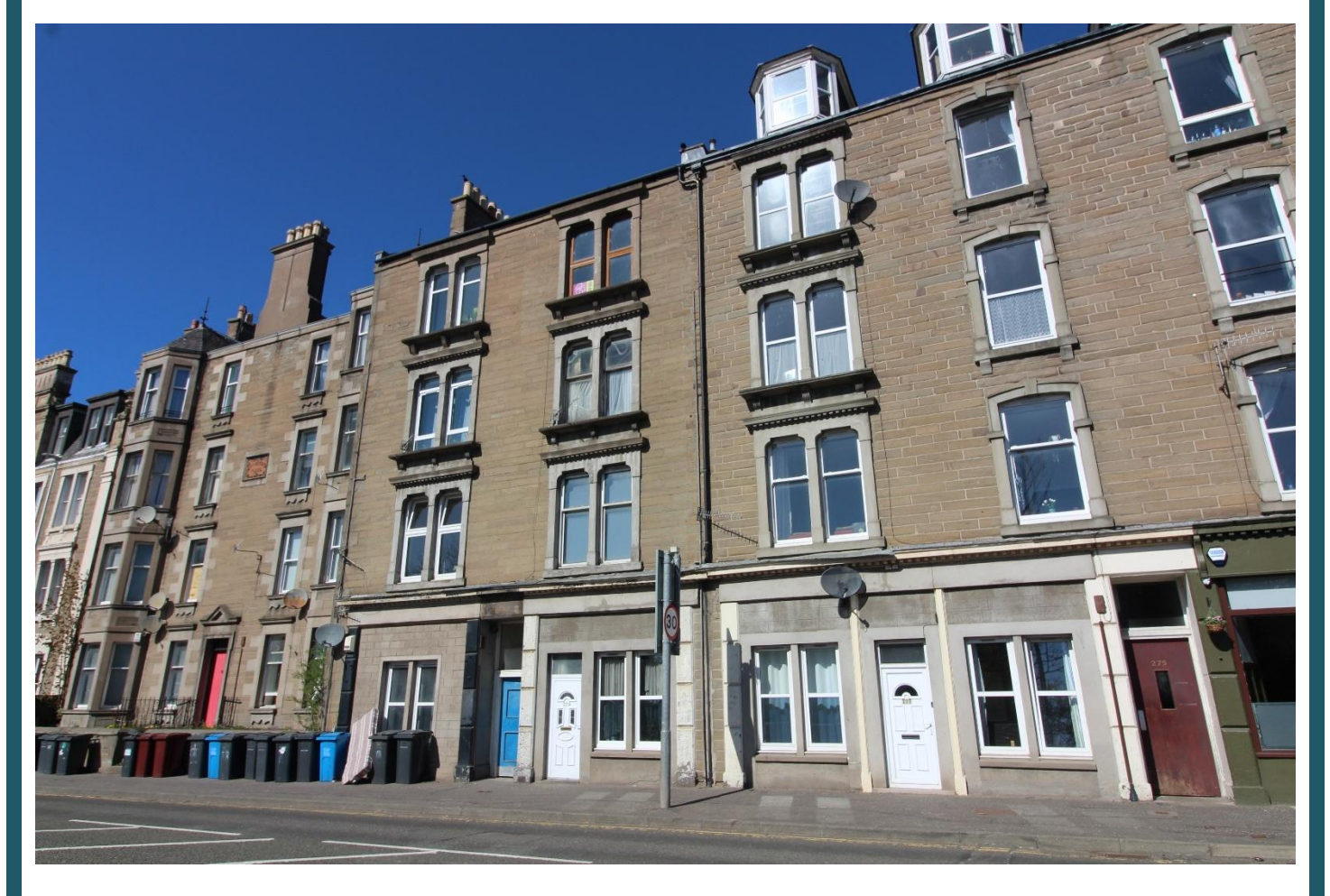
3/L, 281 Hawkhill, Dundee, DD2 1DN