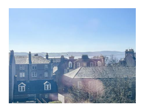
Illustration For Identification Purposes Only. Not To Scale (ID:1164982 / Ref:89930)