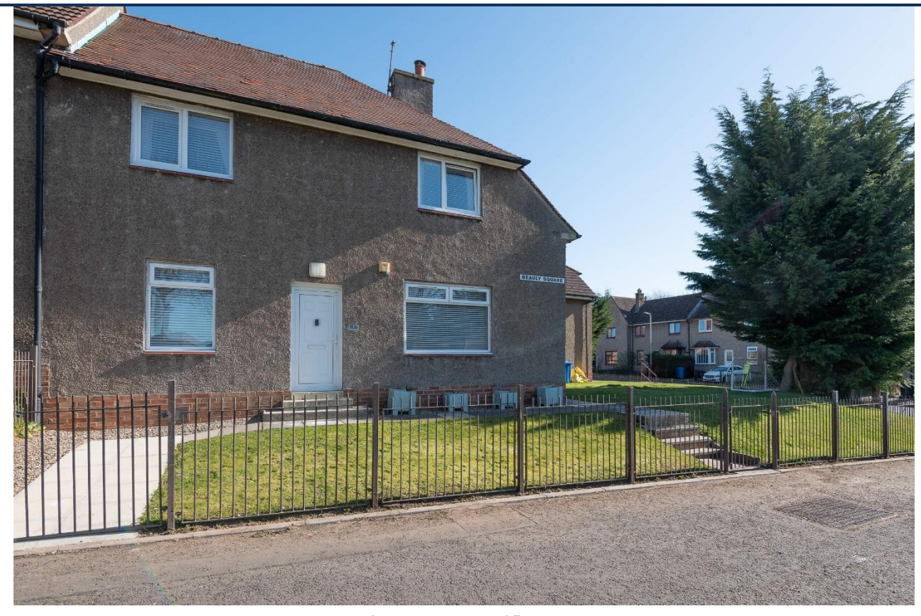
"Spacious Family Home"

Accommodation: - Entrance Vestibule, Hallway, Lounge, Kitchen, Dining Room/3rd Bedroom. Accommodation on First Floor: - Two Bedrooms and Bathroom with ample storage cupboards. Full Double Glazing & Gas Central Heating. Enclosed front and rear gardens.