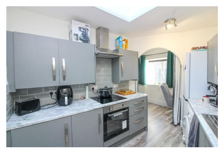
Approx. 3.4m x 2.8m. Fitted with a range of modern floor, wall and drawer units. Integral oven, hob and extractor hood. Tiled to splash back. One and half sink and drainer with mixer tap. Space for further appliances. Double glazed velux window. Feature arch to lounge.