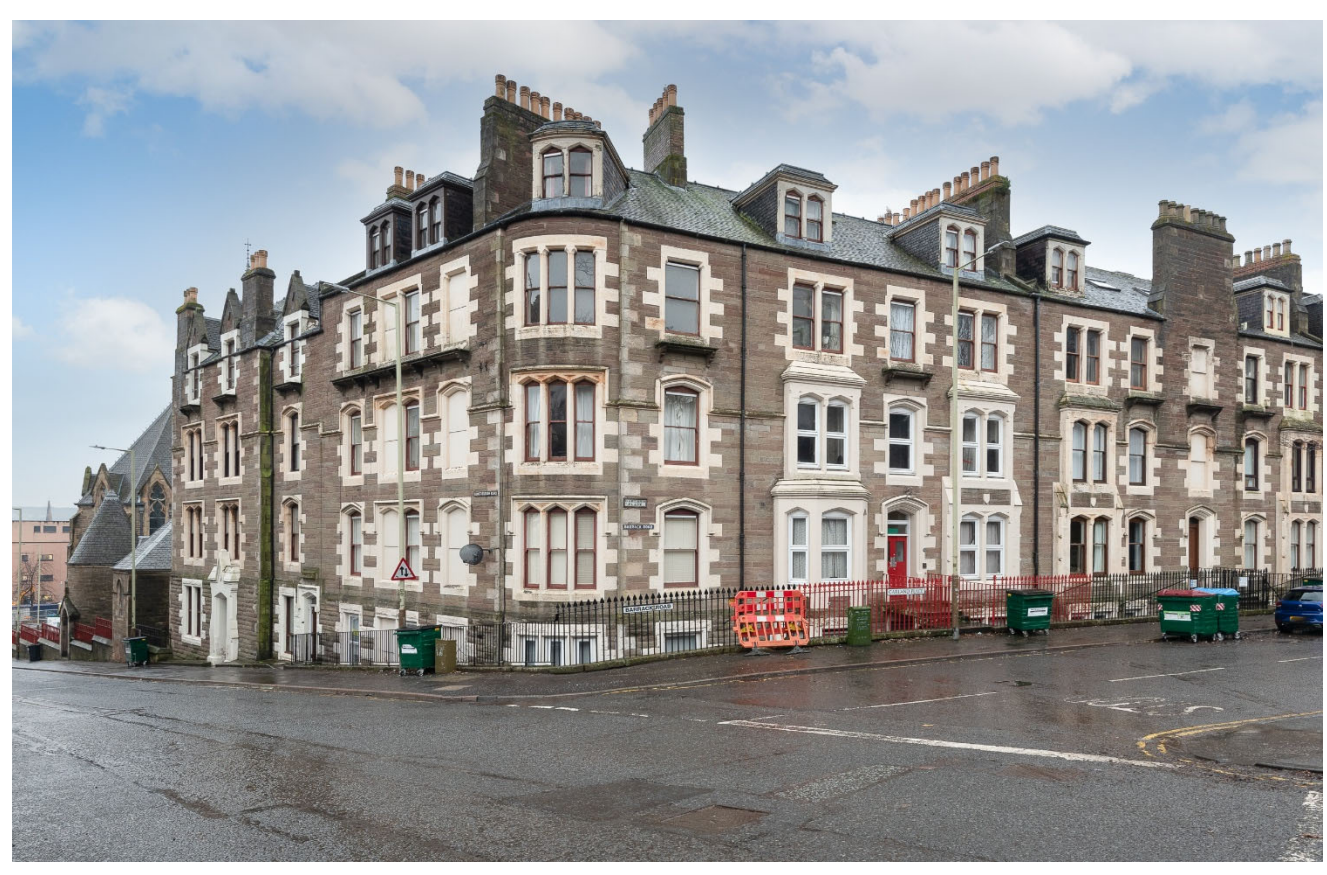
"City Centre Location"

Accommodation on Fourth Floor:- Entrance Hallway, Lounge, Two Bedrooms, Kitchen/Diner, WC Cloakroom, 3 Bedrooms. Accommodation on Attic Floor:- Three Bedrooms, Bathroom with WC and Cloakroom with WC. Partial Double Glazing & Gas Central Heating. Mutual Rear Garden.