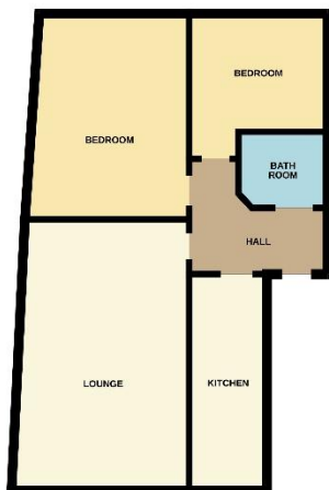
SECOND FLOOR 47.0 sq.m. approx.