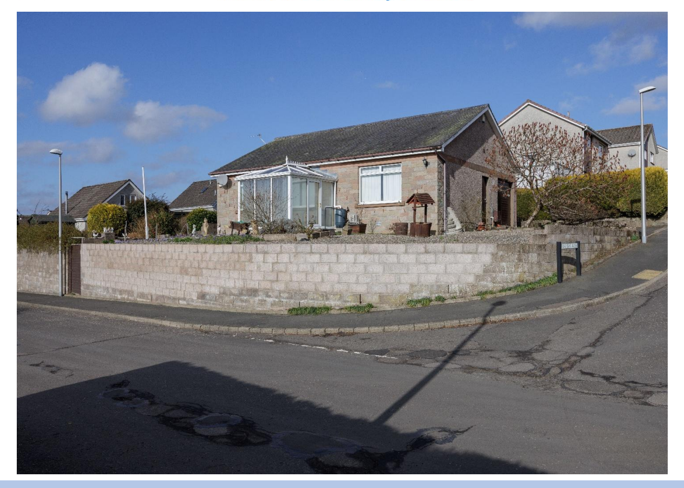
'Tiroran', 16 Turfbeg Crescent, Forfar, DD8 3LN Offers Over £210,000