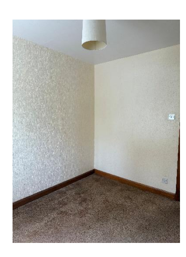
Approx. 3.2m x 2.6m. Another well proportioned room. Double glazed window to side.