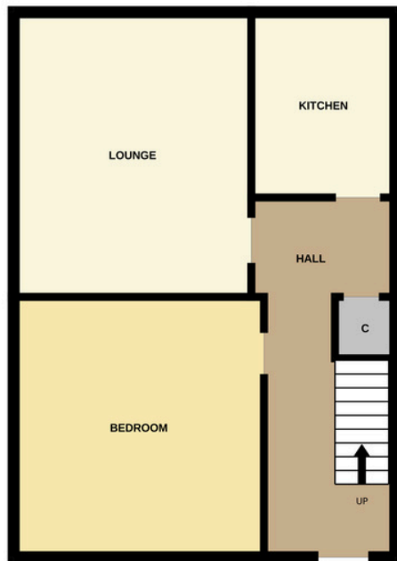
SECOND FLOOR 46.7 sq.m. approx.