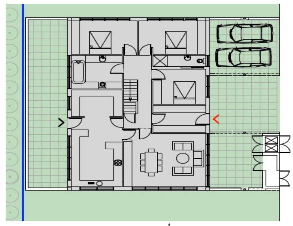
TYPICAL BUNGALOW FLOOR PLAN @ 115 ↑m²

Please contact Shiells for clearer images and drafts of proposed buildings.