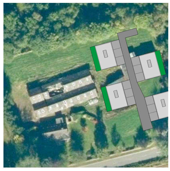
PROPOSED AERIAL PHOTO