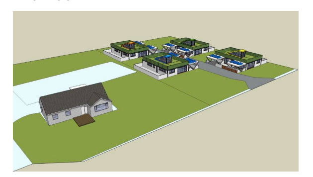
PROPOSED VIEW FROM SOUTH WEST