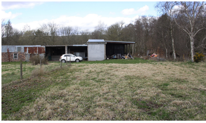
VIEW NORTH ACROSS SITE TO EXISTING OUTBUILDINGS