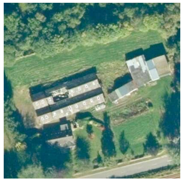
EXISTING AERIAL PHOTO