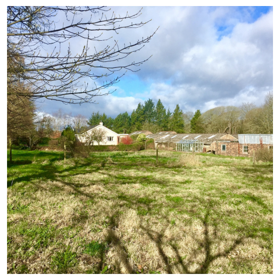
EXISTING PHOTO OF DEVELOPMENT SITE