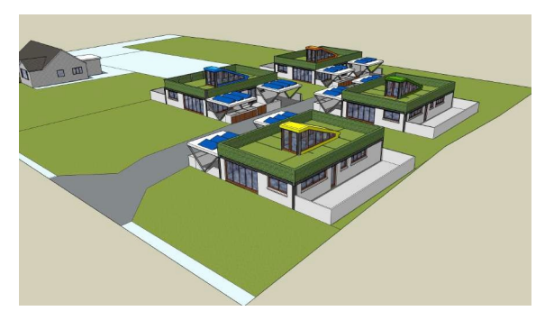
PROPOSED VIEW FROM SOUTH EAST