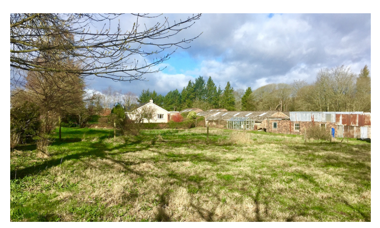
VIEW WEST ACROSS SITE TO EXISTING BUNGALOW