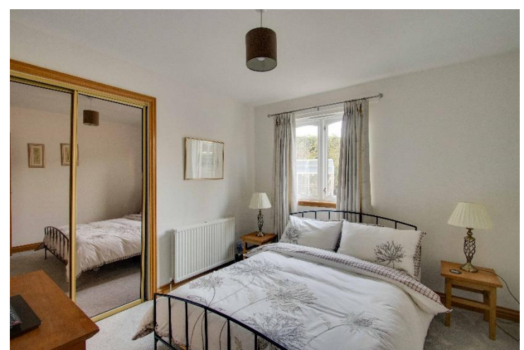
4 Bedrooms, En Suite, Family Bathroom