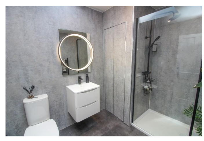
Approx. 2.75m x 2.23m. Modern three piece suite comprising WC, wash hand basin with storage below. Walk in shower enclosure. Full wet wall panelling. Mirror. Double glazed Velux window. Heated ladder style towel rail. Useful airing cupboard with shaver socket and housing the Worcester central heating boiler.