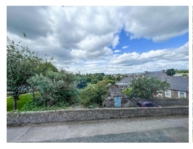
The property occupies an off street location from Glamis Road, and to the rear is a private area of garden ground, bounded by a stone built wall, laid out in lawn, patio and mature herbaceous borders. Log store and brick built store. Shared pathways.