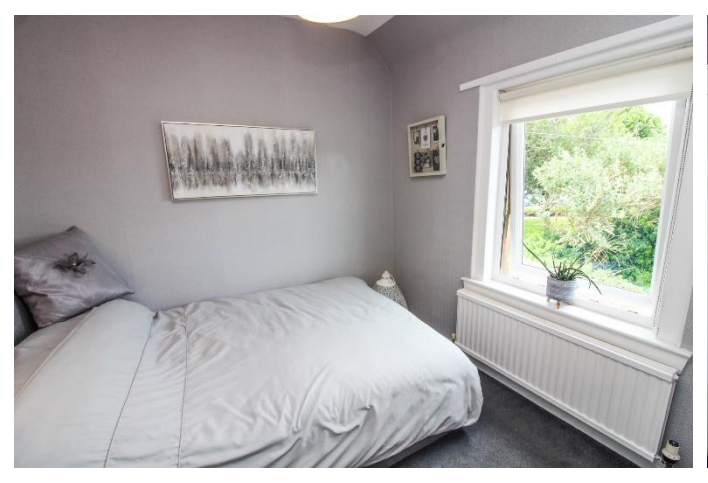
Approx. 2.75m x 2.7m. Double bedroom. Double glazed window to front again enjoying the views.