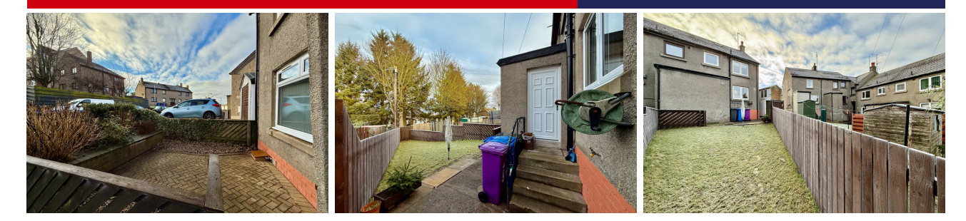
END TERRACED VILLA