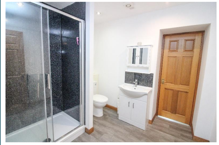
Approx. 2.73m \times 2.37m . Three piece white suite comprising WC, wash hand basin and shower cubicle with wet wall. Extractor fan. Chrome ladder style towel rail.