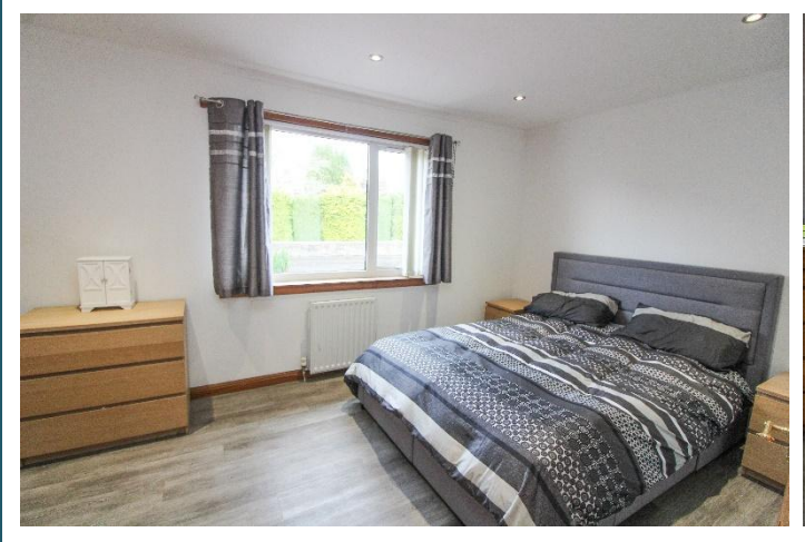
Approx. 3m \times 4.6m . Excellent sized double bedroom. Double glazed window to front. Large, walk in dressing room with shelving, hanging rail and lights.