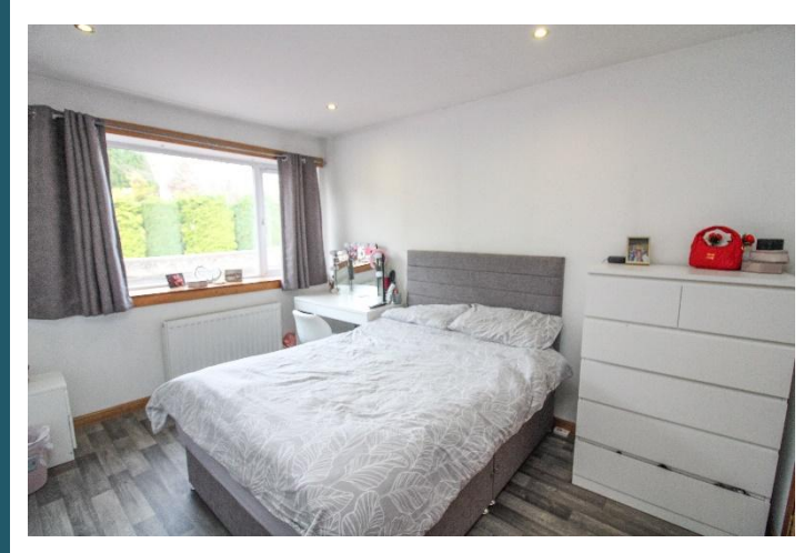
Approx. 4.64m x 3.12m. Spacious double bedroom. Double glazed window to front. Fitted wardrobe.