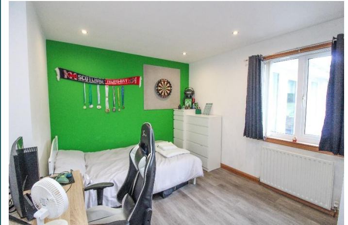
Approx. 3.67m x 3.1m. Double bedroom. Double glazed window to rear.