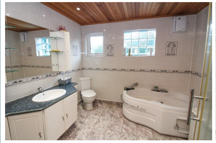
Approx. 3.27 \text{m} \times 2.8 \text{m} . Four piece white suite comprising WC, wash hand basin, corner spa bath and shower cubicle. Fully tiled. Chrome heated towel rail. Double glazed window and glass brick to rear. Expel air extractor fan.