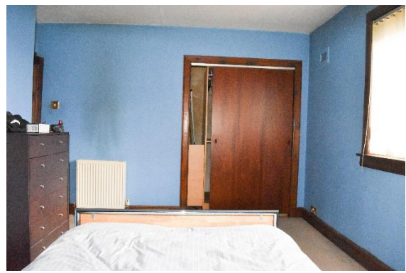
Bedroom 2: (3.65m x 3.1m approx.)

Another good sized Double Bedroom located to the rear of the property. Built-in wardrobe/cupboard. Carpet. Radiator.