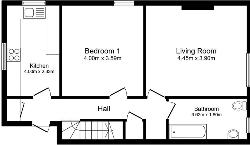
Ground Floor Floor area 60.4 m 2