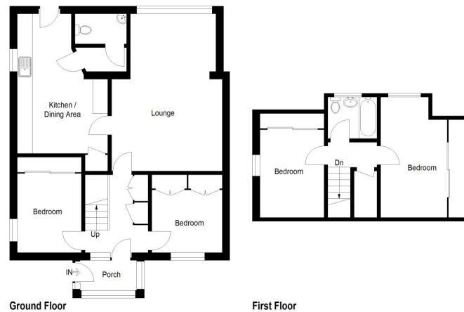
Illustration For Identification Purposes Only. Not To Scale (ID1138847 / Ref.89494)

Easily maintained garden areas to front, rear and side. Rotary drier at rear.