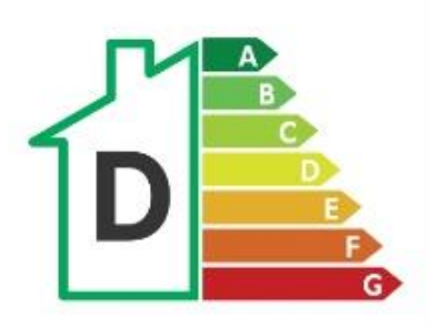
These particulars have been carefully prepared and are believed to be correct, but their accuracy is not guaranteed and prospective purchasers must satisfy themselves as to the various points mentioned herein before offering. All measurements have been taken using an electronic measurement device and are not guaranteed.

Dundee: 01382 203000 Brechin: 01356 622289 Cupar: 01334 658222 www.thechamberpractice.co.uk contact@thechamberpractice.co.uk