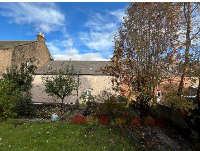
Illustration For Identification Purposes Only. Not To Scale (ID1124584 / Ref.89239)