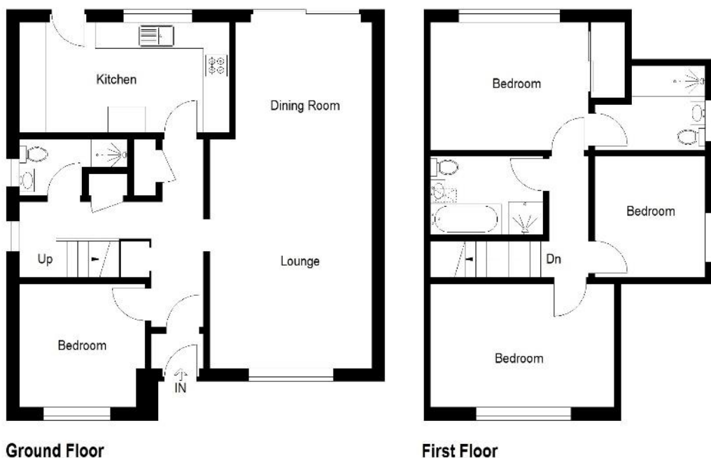
Illustration For Identification Purposes Only. Not To Scale (ID1123046 / Ref:89201)

The large double length garage incorporates a features games room and sauna (with pool table and weights machine included).