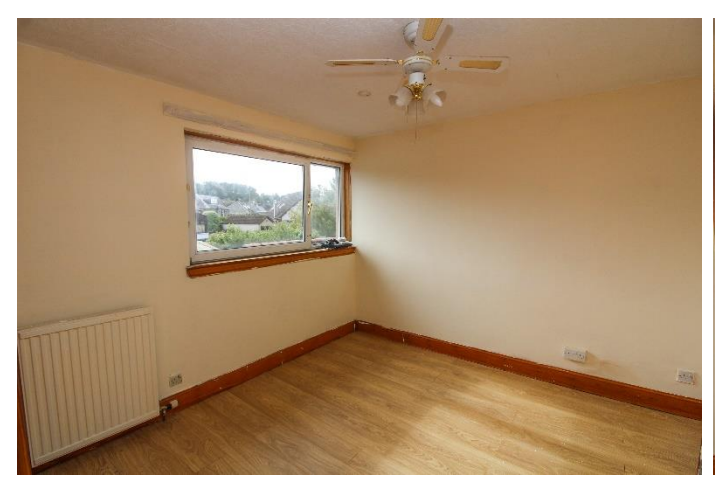
Approx. 3.18m x 3.33m. Another double bedroom. Double glazed window to rear with views to Balmashanner Hill and monument. Useful wardrobe, also housing the central heating combi boiler.