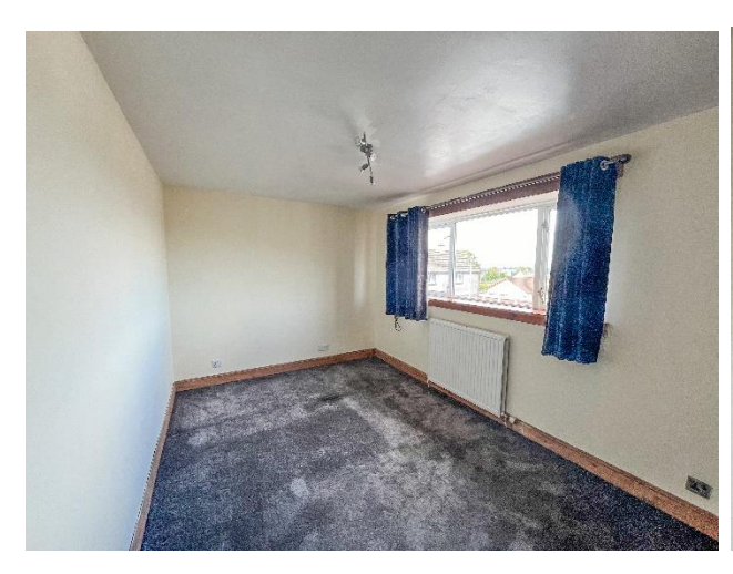
Approx. 4.56m x 2.82m. Spacious double bedroom. Double glazed window to front again enjoying the outstanding views over the town and beyond. Freestanding wardrobes