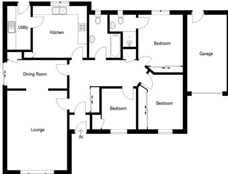
Illustration For Identification Purposes Only. Not To Scale (ID:1113403 / Ref:88923)