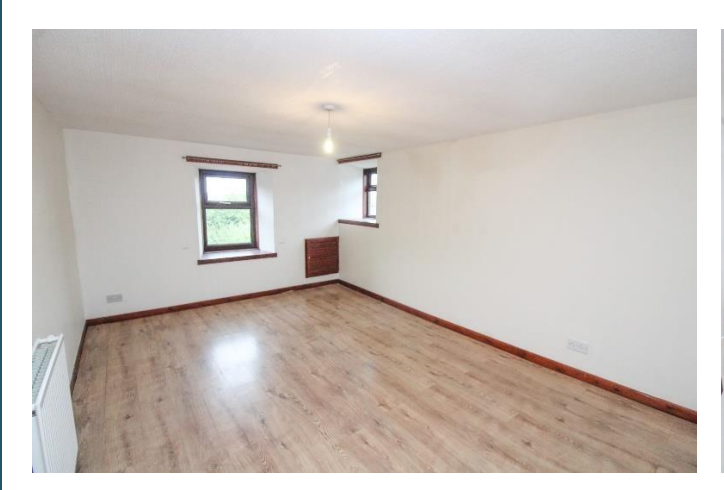
Approx. 3.52 \mathrm{m} \times 4.94 \mathrm{m} . Another spacious double bedroom. Double glazed window to side and rear.