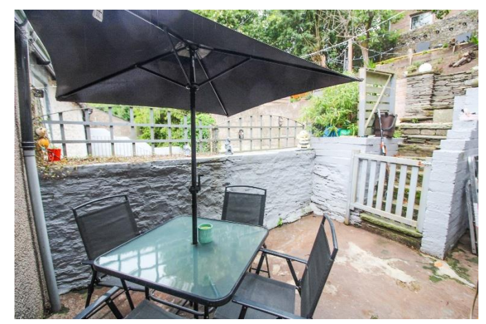
There is a private courtyard accessed via kitchen. Shared landscaped terraced gardens with drystone dyke and raised borders. Terraced garden with a range of mature trees, and planting borders.