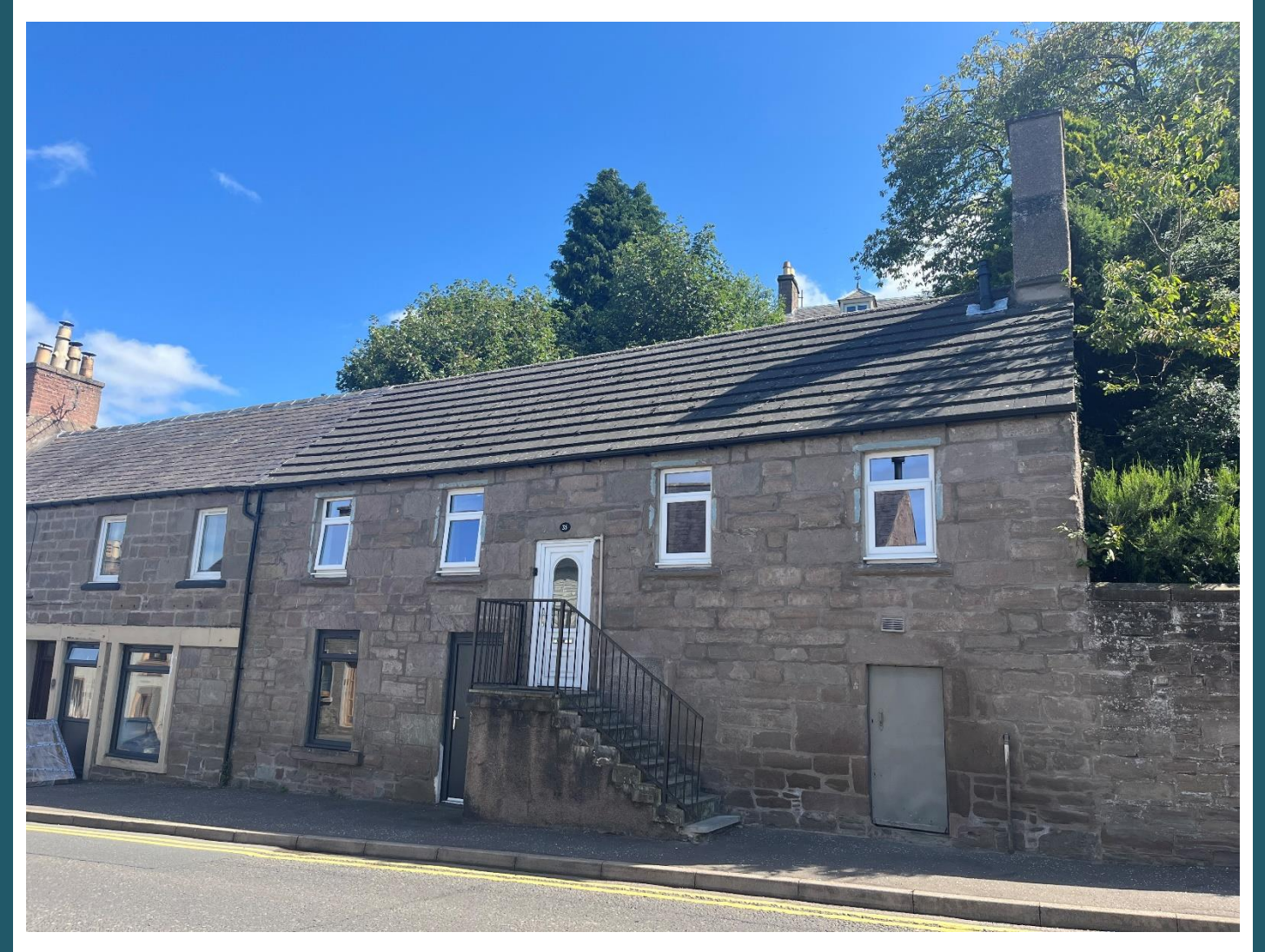
35 Dundee Loan, Forfar DD8 1DY