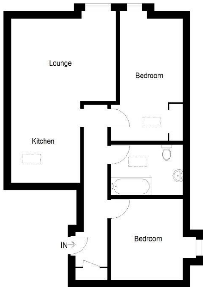
Illustration For Identification Purposes Only. Not To Scale (ID:1110043/ Ref:88831)