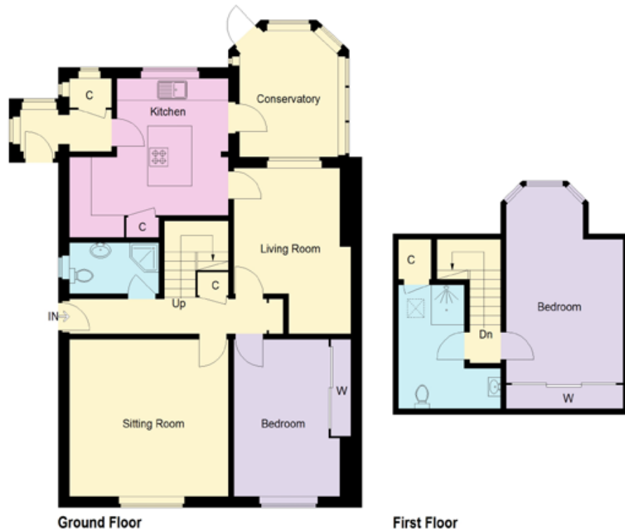
Illustration for identification purposes only, measurements are approximate, not to scale. floorplansUsketch.com © (ID1109136)