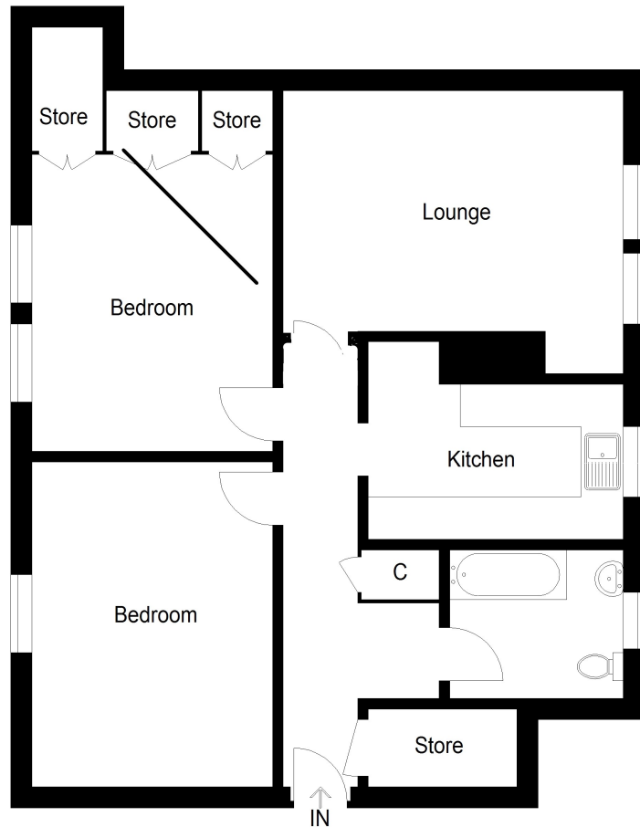
Illustration For Identification Purposes Only. Not To Scale (ID:1104389 / Ref:88652)