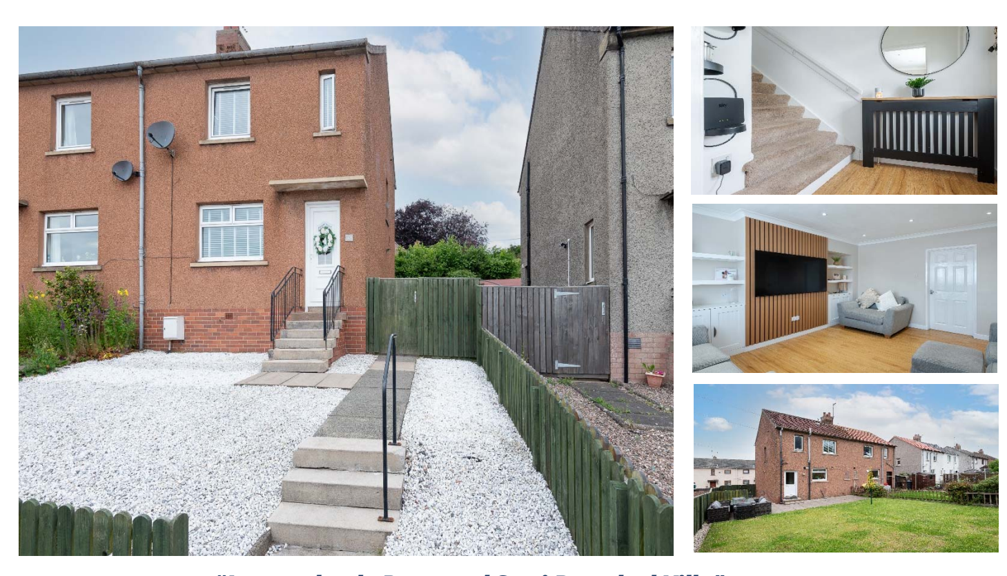
"Immaculately Presented Semi Detached Villa"

Accommodation: Entrance Hall, Lounge, Modern Dining Kitchen, Two Double Bedrooms, Bathroom, Double Glazing, Gas Central Heating and Gardens.