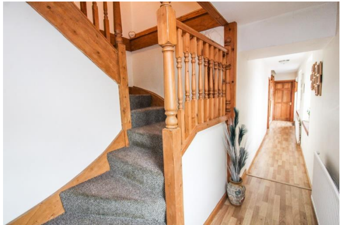
Upper Floor South Wing: