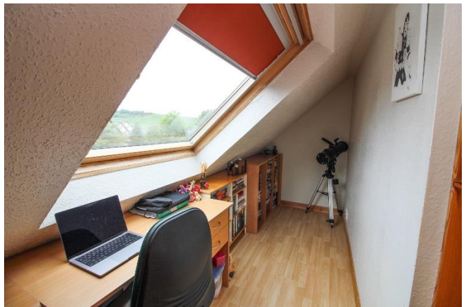
Upper Floor in North Wing: